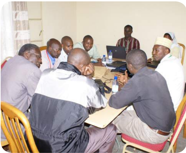
Religious education panelists

Religious Education deals with the philosophical explanation of spirituality, beliefs about the nature and attributes of God as well as the foundations of different faiths. Religion subject syllabus will contribute to moral and spiritual development of the young people by developing values such as faithfulness, generosity, honesty, goodness, respect, responsibility, self-control, self-esteem and accountability that will help them to make good decisions and sound judgment about moral and life issues.