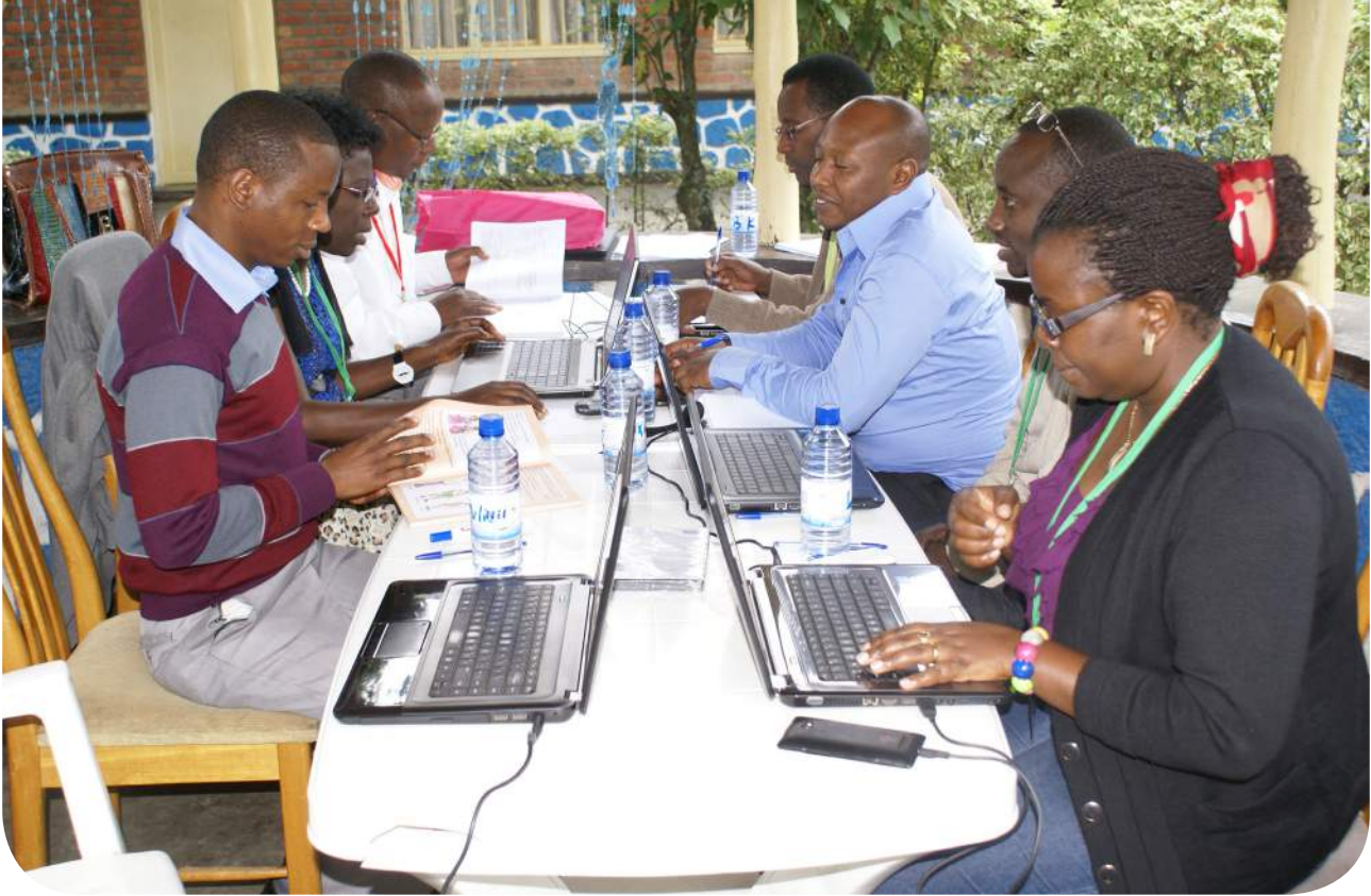
Social studies panelists