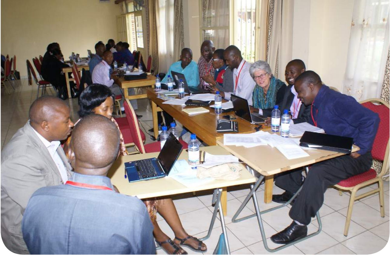
English language panelists