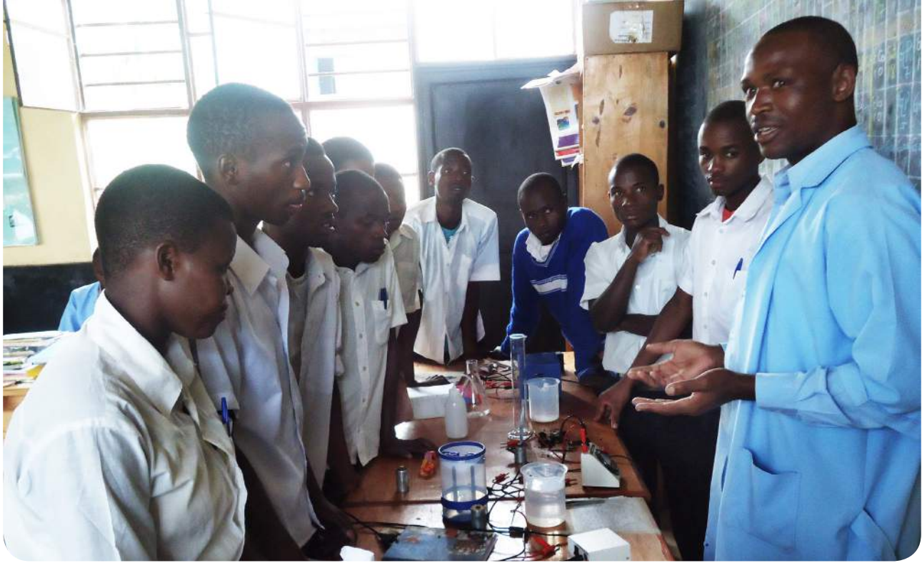
Students in science laboratory