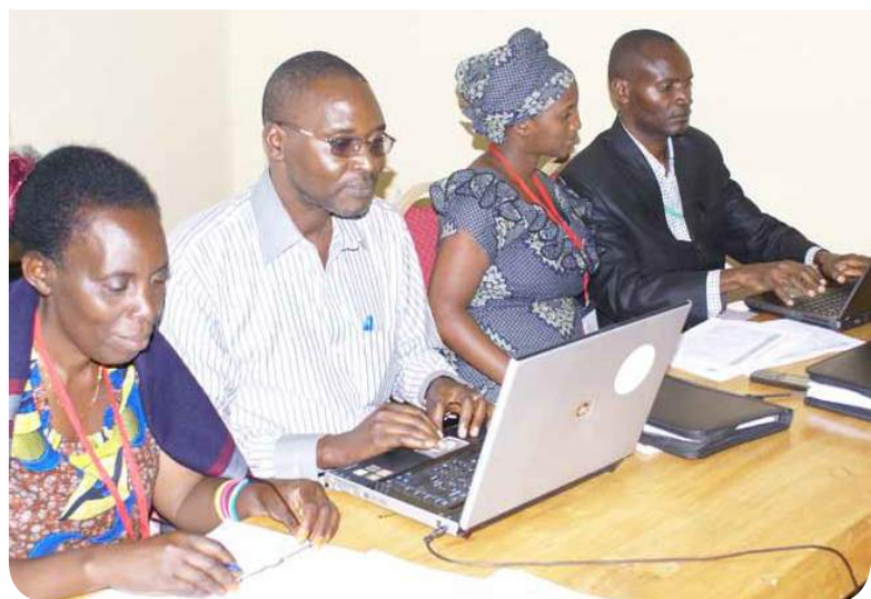
Fine Arts Panelists

Arts and Crafts equips learners with knowledge, skills and attitudes necessary to enable them to develop abilities such as creative thinking, decision-making, problem-solving and vision articulation as well as a wide variety of social skills, including communication, sharing and appreciation, that will help them to succeed in an era of rapid technological growth and socio-economic development.