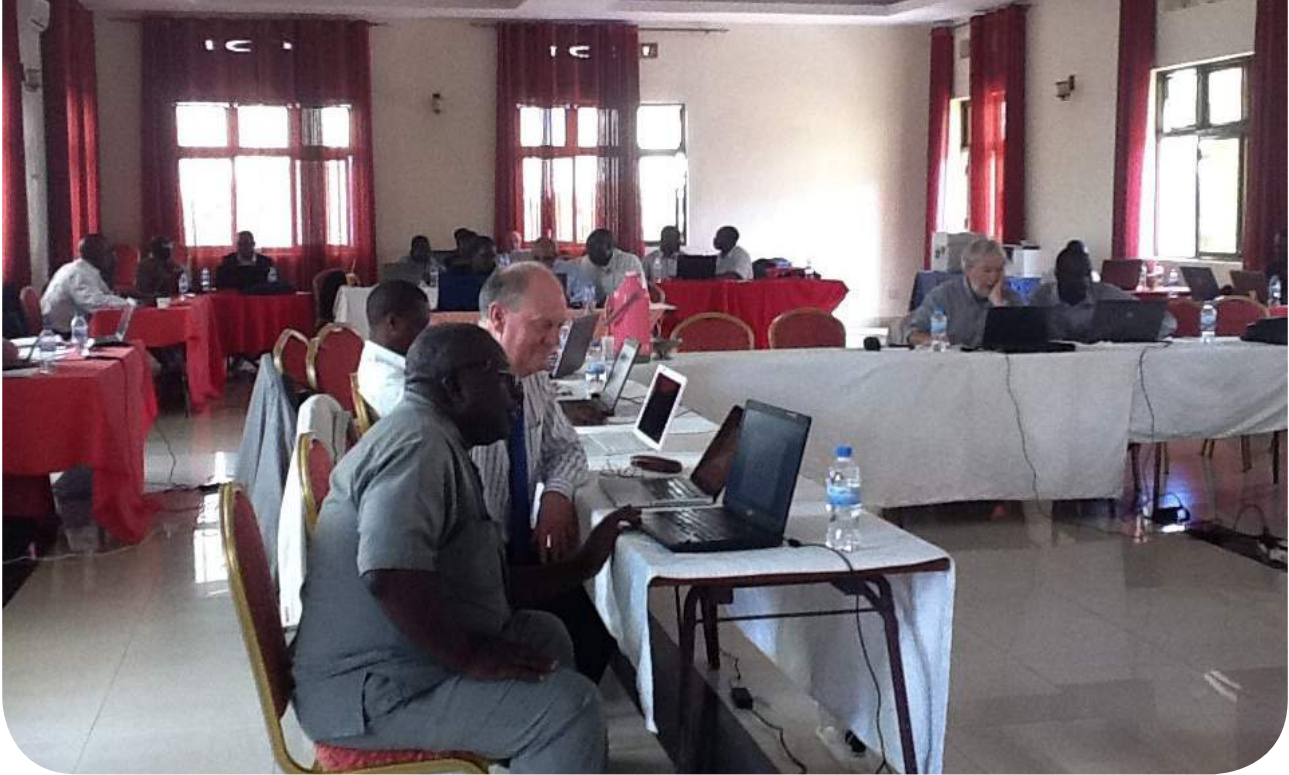
Curriculum developers in a session