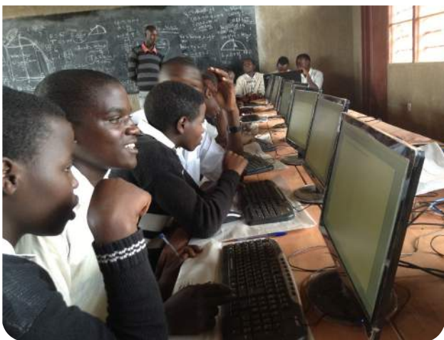
Students in computer laboratory