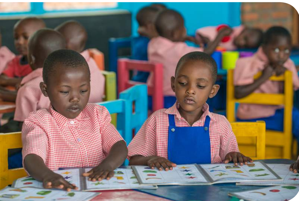
Pre-primary children reading

Inclusion is based on the right of all learners to a quality and equitable education that meets their basic learning needs, and understands the diversity of backgrounds and abilities as a learning opportunity.