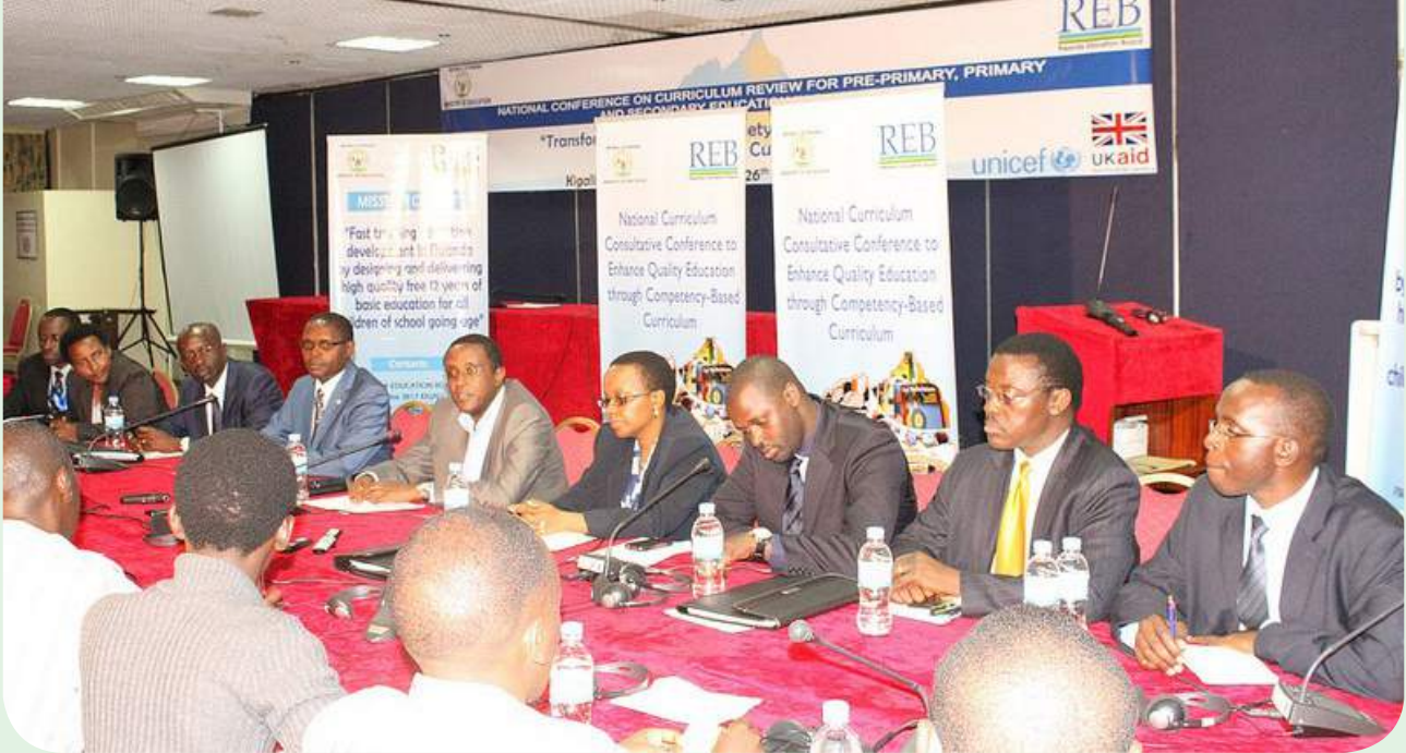
National Curriculum Consultative conference