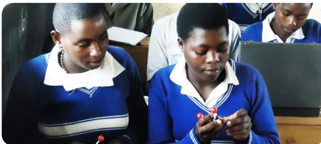
Students in a chemistry class

The most helpful reporting is to share with parents what students are doing well and where they need to improve.